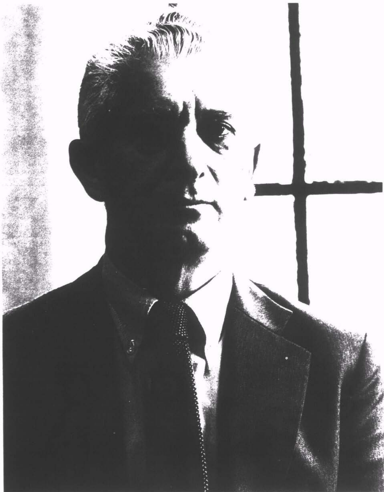
Benjamin S. Bloom is Charles H. Swift Distinguished Service Professor of Education, the University of Chicago.