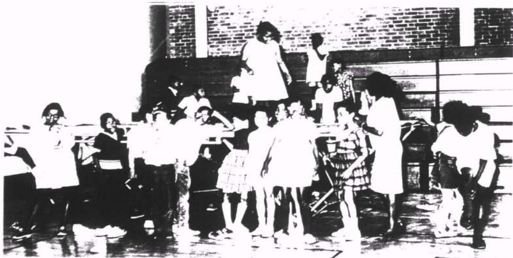
Children prepare for instruction in use of the trampoline.