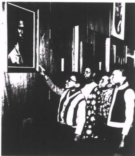
Pupils show appreciation for work done by black artists.

A School Band. A committee of parents working closely with school people has helped to start a school band. There are 40 fifth- and sixth-grade students taking instrumental music lessons. The parents, through different fund raising projects, were able to buy many instruments for the children to use. These helped supplement instruments bought for the school by the Board of Education.