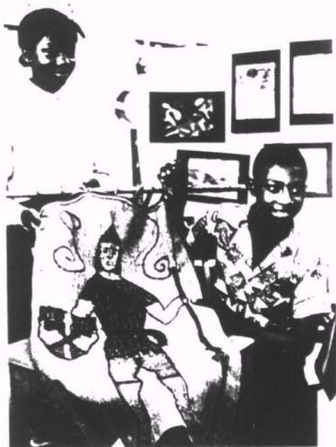
Original works are displayed at a children's art fair.

a medical and dental suite; rooms for home economics, arts and crafts, music, and recreation; a community social agency office (C.P.I.) and many small offices and meeting rooms. Some specific activities have included: