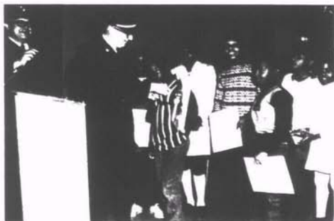
New Haven fire chief participates in installing new junior fire marshals.

and the Amistad, paintings done by black artists and of black subjects, are proudly displayed for children, the community, and visitors to see. Periodic shows of Negro history and biographical materials are displayed in the halls and classrooms. These materials have done much to develop in each student racial self-pride and a good self-image to foster better learning and study habits.