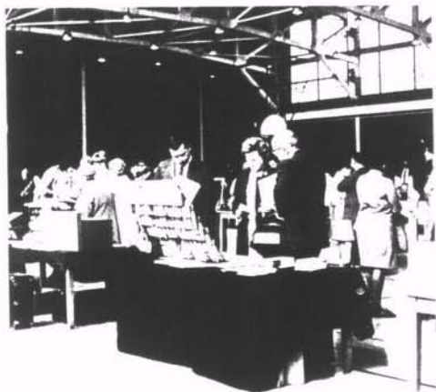
Teachers and community members examine materials at a city-wide reading exhibition.

What is happening inside a community school? From 8 a.m. to 10 p.m. each community school is a beehive of excitement and activity. Using Winchester Community School as an example, the physical plant includes 32 classrooms; a full-size gymnasium with bleachers, locker rooms, and showers; a 540-seat auditorium; a large cafeteria; a 100-seat little theater; a 9,000-book library; the city's department of audio-visual education;