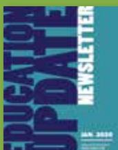
Education Update Newsletter