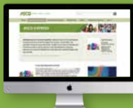
ASCD Express Newsletter